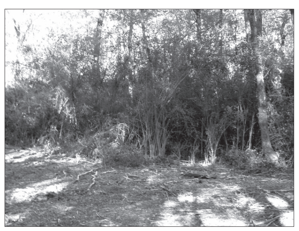
Figure 1—Site 1: Pretreatment.