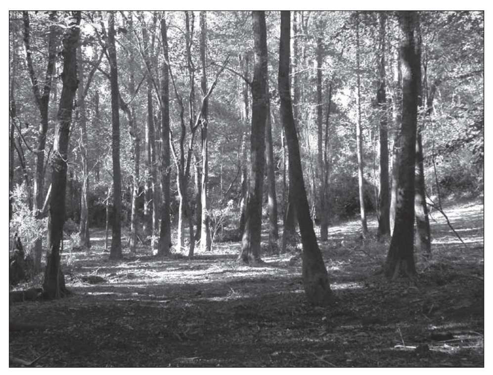
Figure 2-Site 1: Post-treatment.