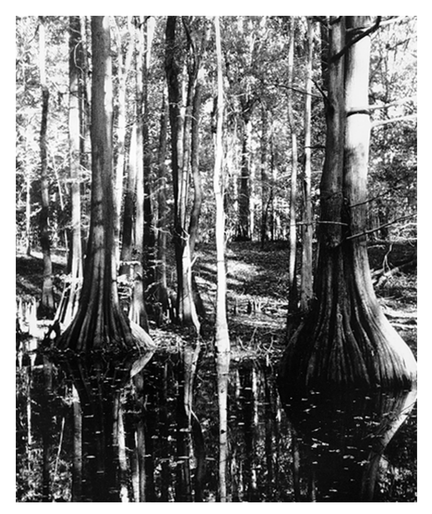
Figure 12.—An area of Urbo-Mooreville-Una complex, gently undulating, frequently flooded. Una soils, ponded, are in the low swales in the foreground. The Urbo and Mooreville soils are on the low ridges in the background. The swollen or enlarged lower trunks of the baldcypress trees are adaptations that help the trees tolerate the excessive wetness of the Una soils.