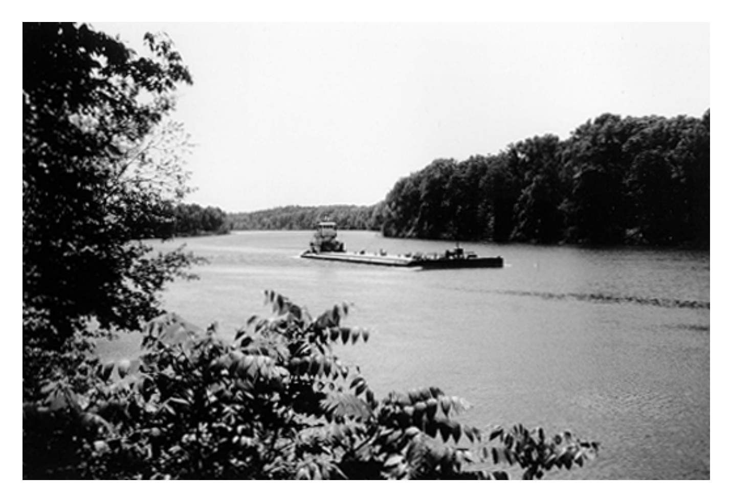
Figure 2.—The Tombigbee River, which has served as a major avenue of transportation throughout the history of the county. Tugboats pushing barge loads of oil, coal, sand, gravel, and lumber have replaced the steamboats transporting cotton and passengers from earlier years.

In 1944, oil was discovered in the county and more than 800,000 barrels were produced annually from 62 wells (Pashin et al., 1998; Toulmin, LaMoreaux, and Lanphere, 1951). Today, about 6,000 barrels per month are pumped from 25 wells.