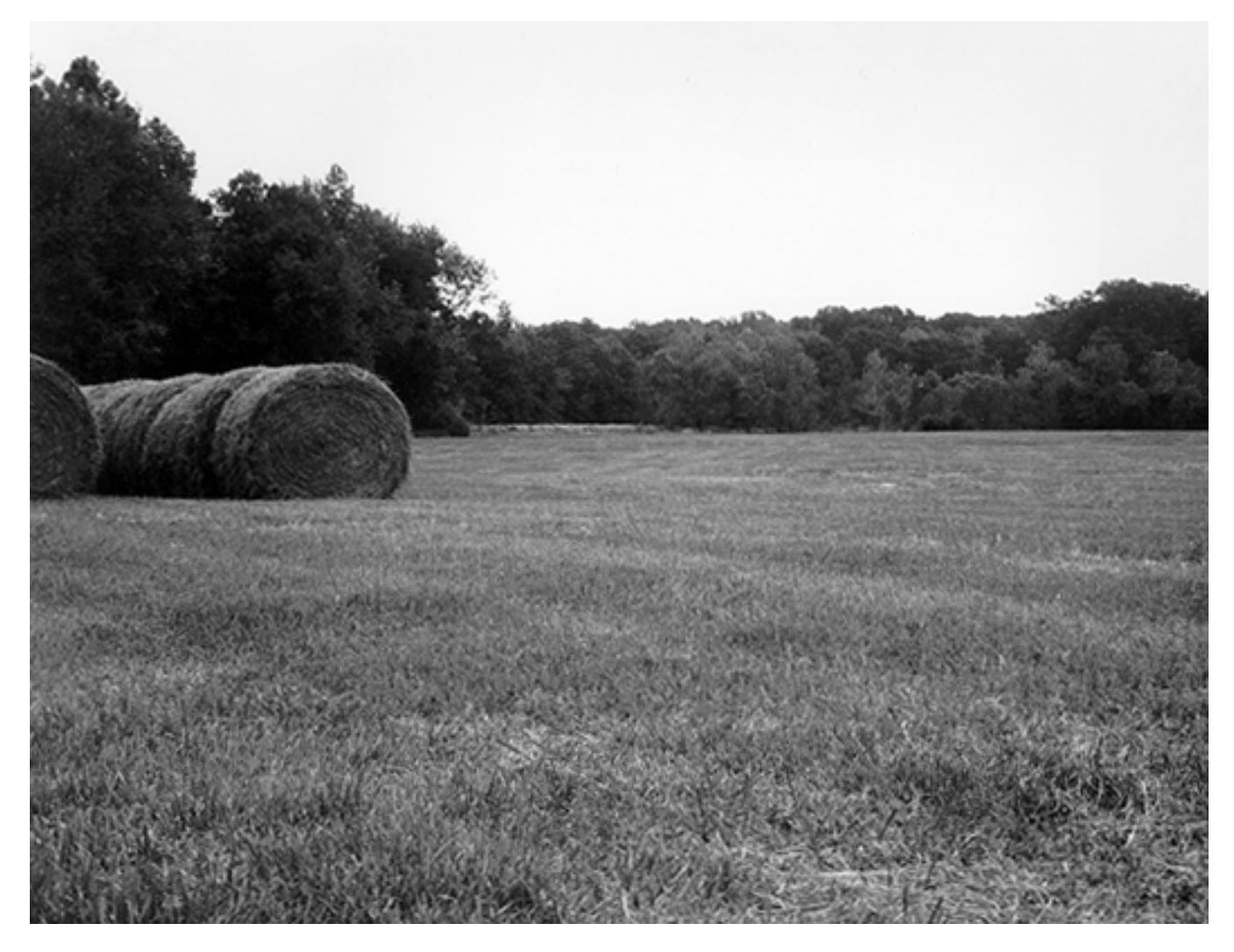
Figure 4.—An area of Cahaba sandy loam, 0 to 2 percent slopes, rarely flooded. This well drained soil is well suited to bermudagrass and bahiagrass hay.