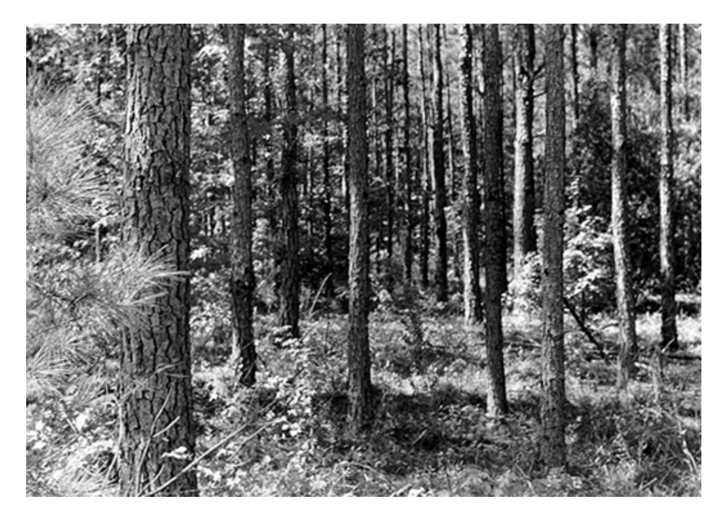
Figure 6.—A well managed stand of loblolly pine in an area of Luverne sandy loam, 1 to 5 percent slopes. Most areas of this soil are used for timber production and as habitat for turkey and deer.