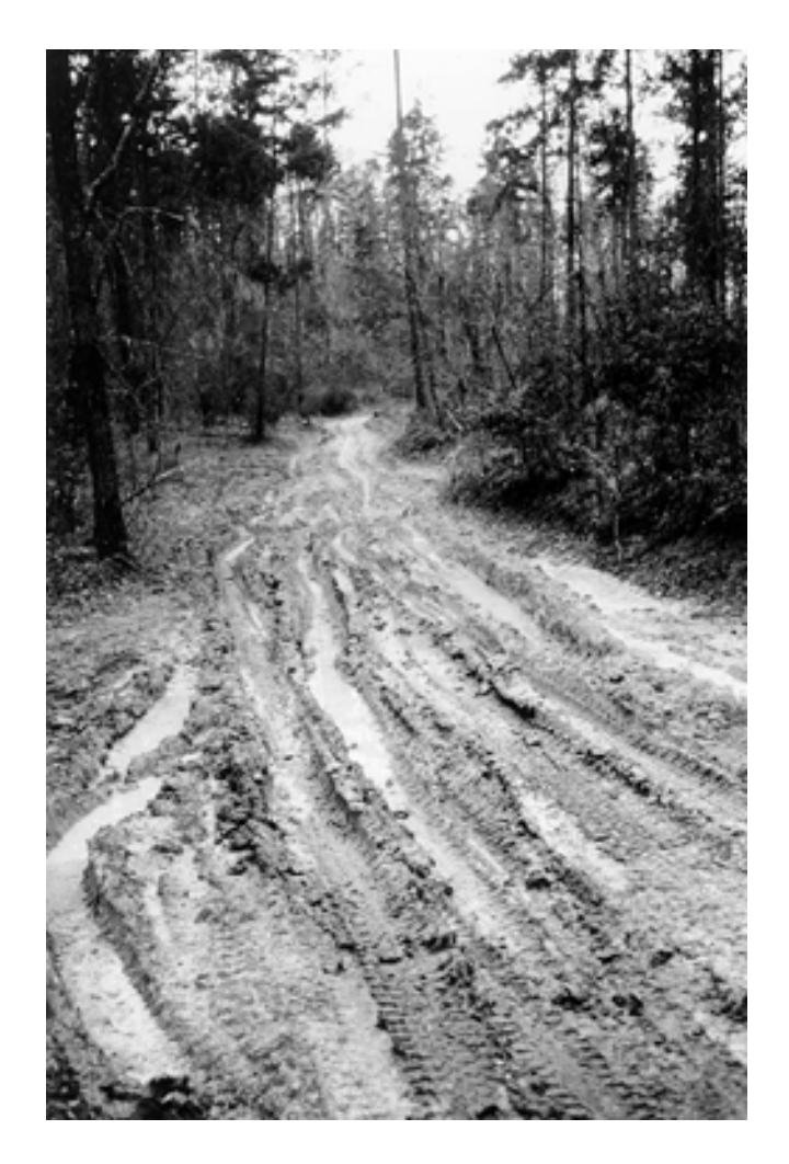
Figure 11.—A road in an area of the Toxey-Brantley-Hannon complex, 3 to 8 percent slopes, eroded. Roads and trails in areas of this map unit become almost impassable during wet weather. Timber management and harvesting operations should be planned for the drier periods of the year.

• Openland wildlife habitat can be improved by leaving undisturbed areas of vegetation around cropland and