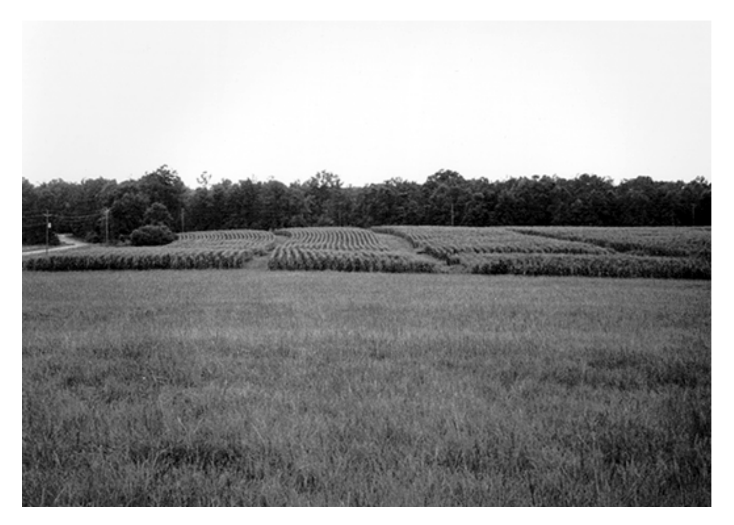
Figure 7.—An area of McLaurin fine sandy loam, 2 to 5 percent slopes. This soil is well suited to pasture, hay, and cultivated crops.