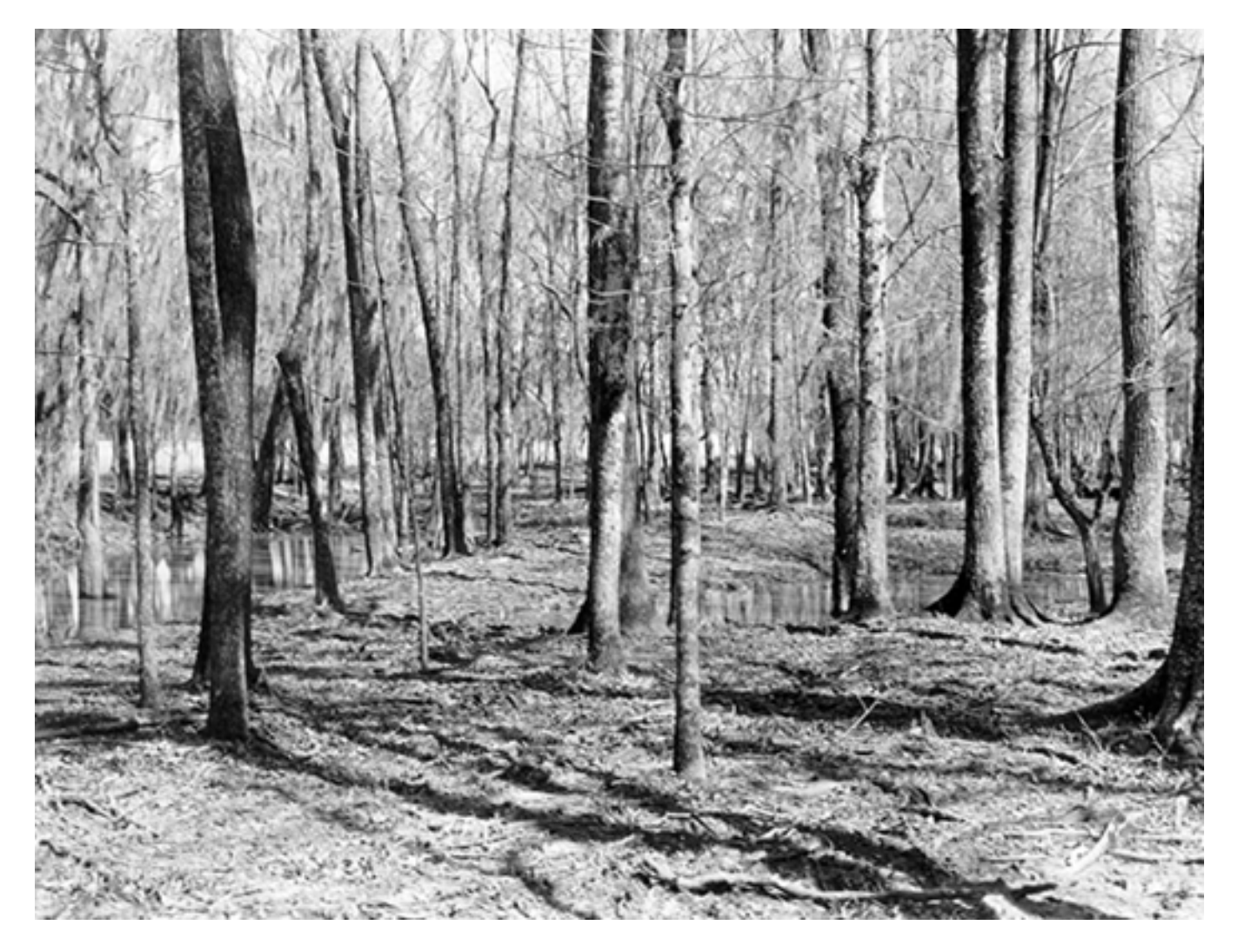
Figure 8.—Bottomland hardwood forest in an area of Ochlockonee, Kinston, and luka soils, 0 to 1 percent slopes, frequently flooded. Such areas provide habitat for deer, turkey, squirrel, songbirds, and waterfowl. Flooding and wetness are limitations affecting most uses.