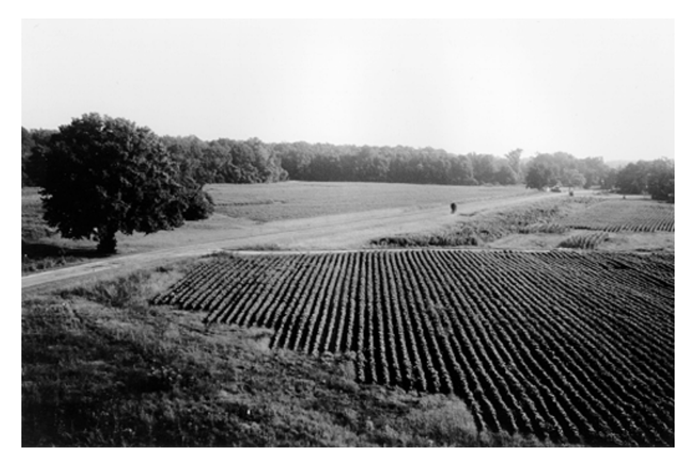
Figure 9.—An area of Riverview loam, 0 to 2 percent slopes, occasionally flooded. Good crops of cotton and soybeans can be produced in areas of this soil in most years. The flooding, however, delays planting or damages crops in some years. The woodland in the background is an area of Urbo-Mooreville-Una complex, gently undulating, frequently flooded.

Seasonal high water table: Apparent, at a depth of 3.0 to 5.0 feet from December through April Shrink-swell potential: Low