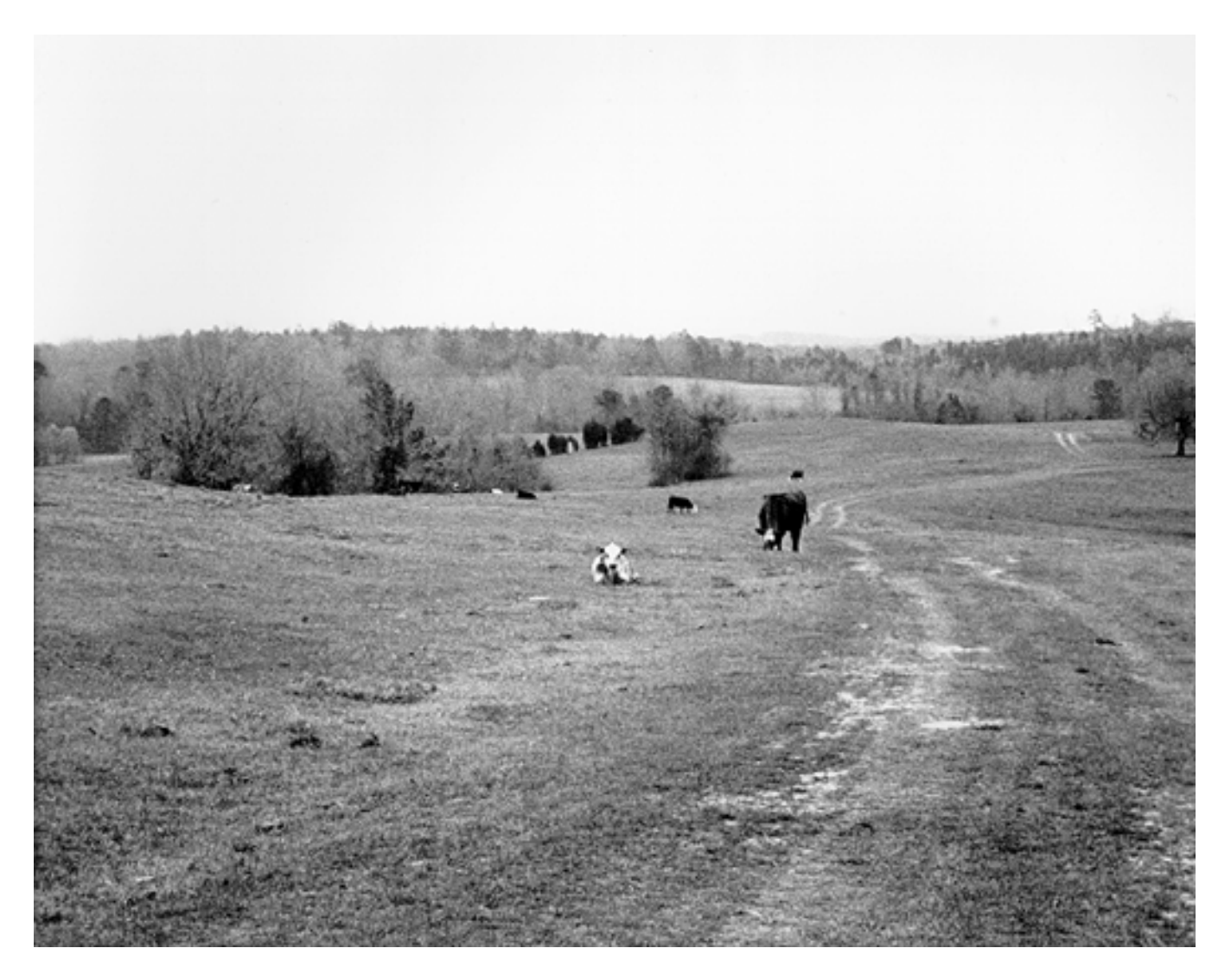
Figure 10.—An area of Sumter-Maytag complex, 3 to 8 percent slopes, eroded, which is suited to pasture and hay.

restricted permeability; Maytag—restricted permeability