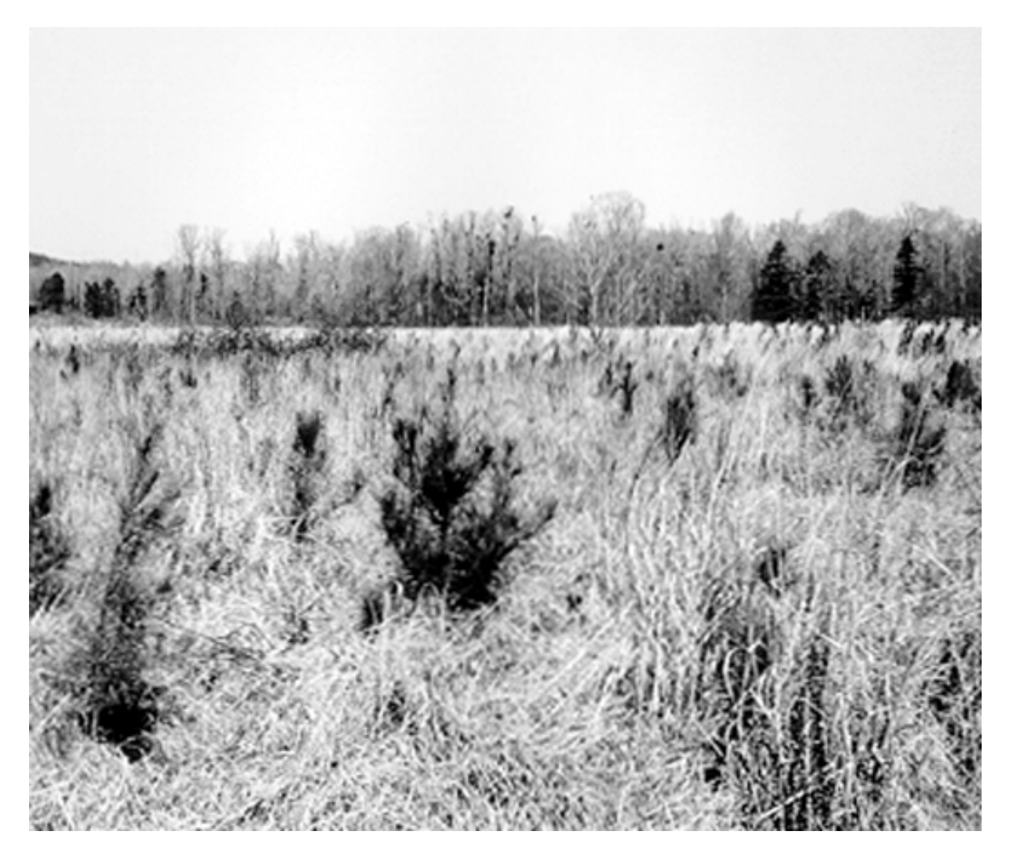
Figure 5.—Loblolly pine seedlings in an area of Lenoir silt loam, 0 to 2 percent slopes, rarely flooded. In Choctaw County, many areas that previously were used for pasture or cultivated crops have been converted to pine woodland.

• Installing distribution lines during dry periods minimizes smearing and sealing of trench walls.