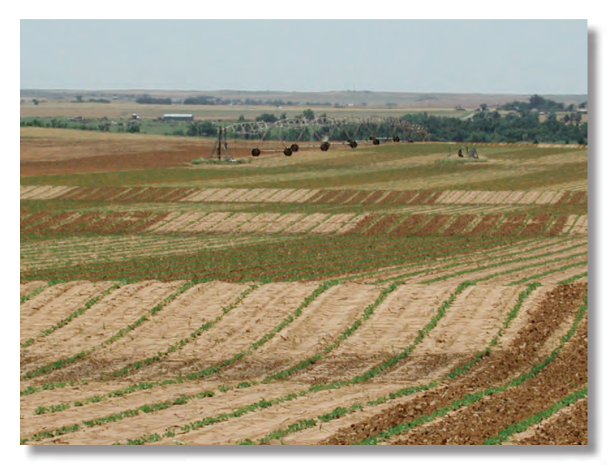
Peanut field near Eakly, Oklahoma (photograph by W. A. Battaglin).

per year (mt/yr) in 1992, 5,404 mt/yr in 1997, and 3,936 mt/ yr in 2002 (Gianessi and Reigner, 2006). In 2002, the estimated use of chlorothalonil on peanuts in Texas was 50.0 mt, and the total use on all agricultural products was 85.4 mt. In Oklahoma the estimated use of chlorothalonil on peanuts was 10.3 mt, whereas the total use on all agricultural products was 18.8 mt (Gianessi and Reigner, 2006). Acres of harvested peanuts in 2002 (U.S. Department of Agriculture, 2007b) and the estimated annual application of chlorothalonil circa 2002 (Gianessi and Reigner, 2006) are shown in figures 1 and 2.