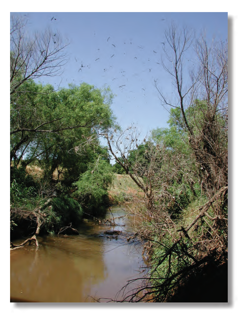
Cobb Creek near Eakly, Oklahoma.

other pesticides or pesticide TPs (2,4-D, bentazon, carbaryl, deisopropylatrazine, hydroxyatrazine, 2-hydroxyatrazine, malathion, oryzalin, pendimethalin, prometon, propargite, simazine, terbacil, and triclopyr) were detected in four or fewer samples. The concentration of carbaryl exceeded the freshwater aquatic-life standard (Environment Canada, 2007) of 0.2 \mu g/L in one sample from San Miguel Creek in Texas. No other pesticide or pesticide TP exceeded its freshwater aquatic-life standard, but such standards are available for only 8 of the 22 compounds listed in table 2.