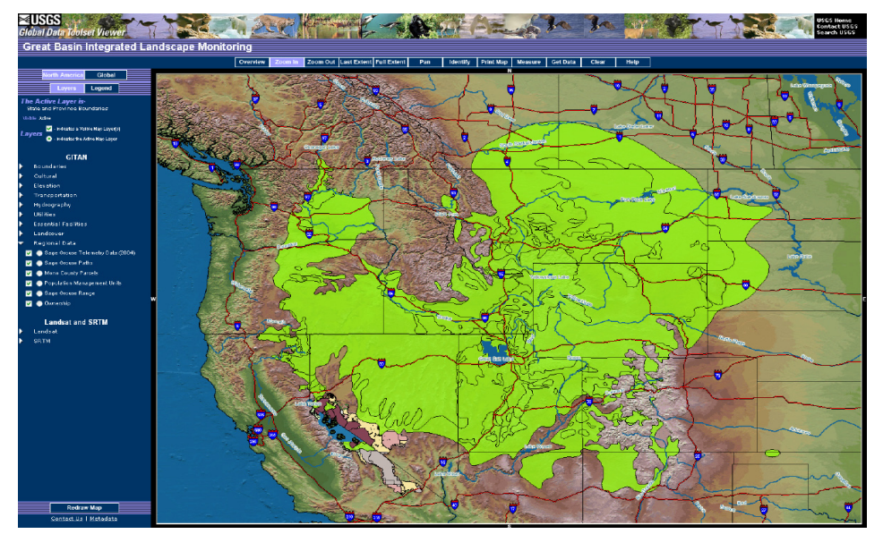
Example of a Regional Study Application

A wide variety of geospatial data is contained in the GDT including global