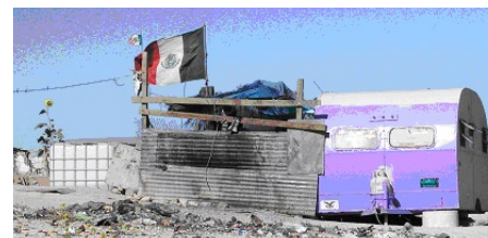
Figure 1. A house in a colonia of Agua Prieta, Sonora.

Each Web-based mapping site incorporates common-base data layers, including transportation, digital orthophoto quadrangles (DOQs), digital raster graphics (DRGs), Landsat imagery, colonia boundaries, hydrography, demographics, and geographic names.