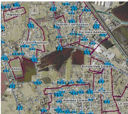
Figure 3. Waterlines and sewerlines in El Paso, Texas.